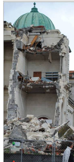
Catholic Cathedral damaged in Christchurch earthquakes

A major exhibition that focuses on early immigrants to Marlborough. Including a re-creation of ship life, with replica cabins, delightful artefacts from the collection, photos of early Marlborough founders, and exquisite dresses. Don't miss seeing this great exhibition.