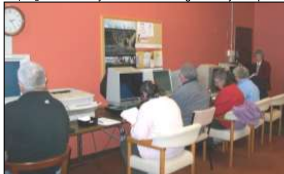
The microfiche/film research room'