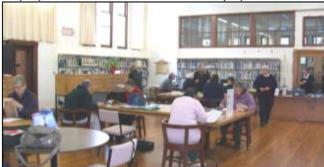
The main research area in the Heritage Room