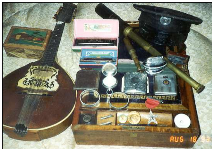
Heirlooms of Bert ISTED (except writing slope which belonged to my maternal grandfather)