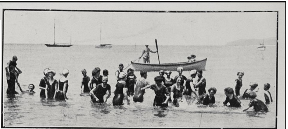
ONE OF THE MOST POPULAR HOLIDAY RESORTS OF AUCKLAND: MIXED BATHING AT ARKLE'S BAY.

From Te Aroha News Volume XLI, Issue 6595, 5 May 1925