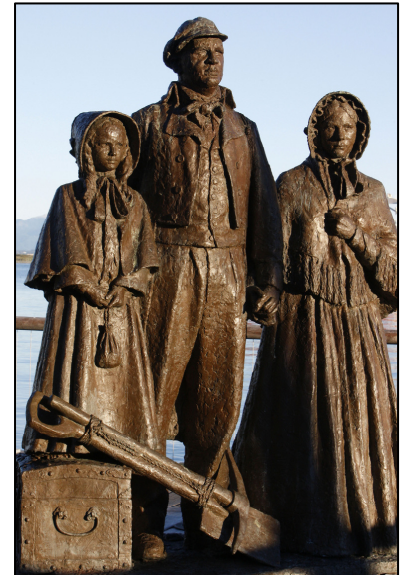
Early Settlers - Port Nelson

Our monthly meetings are at Smith's Hall, corner Waimea & Quarantine Roads Annesbrook on the 4th Monday of the month February to November at 7.30pm . Door charge GOLD COIN DONATION .