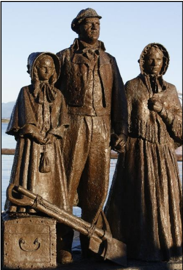
Early Settlers - Port Nelson

Our monthly meetings are at Smith’s Hall, corner Waimea & Quarantine Roads Annesbrook on the 4th Monday of the month February to November at 7.30pm . Door charge GOLD COIN DONATION .