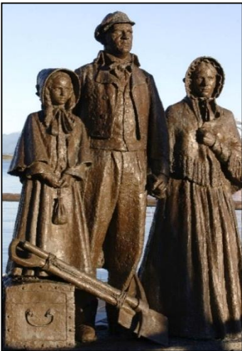
Early Settlers - Port Nelson

Our monthly meetings are at Smith's Hall, corner Waimea & Quarantine Roads Annesbrook on the 4th Monday of the month February to November at 7.30pm. except for June, July and August which will be on Sundays at 2pm. Door charge GOLD COIN DONATION . Our postal address is NZSG Nelson Branch, P O Box 1879, NELSON 7140 Our e-mail address is Nelson@genealogy.org.nz Please note this has changed. Our Branch Library Ancestors Attic is at 67 Trafalgar Street.