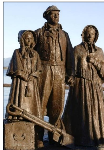
Early Settlers - Port Nelson

PLEASE NOTE THAT DUE TO THE GENERAL ELECTION MEETINGS FROM MAY TO OCTOBER WILL BE HELD AT THE MEETING ROOM NEXT TO THE ATTIC AT 67 TRAFALGAR STREET except for July which is a visit to the Mapua Maritime Museum.