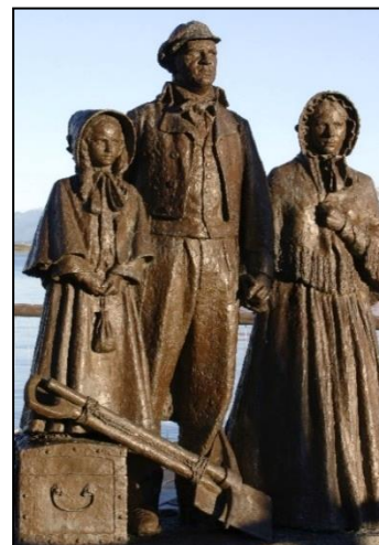
Early Settlers - Port Nelson

PLEASE NOTE THAT OUR FEBRUARY MEETING IS AT THE TRAFALGAR STREET HALL as Nick Smiths Hall is unavailable .