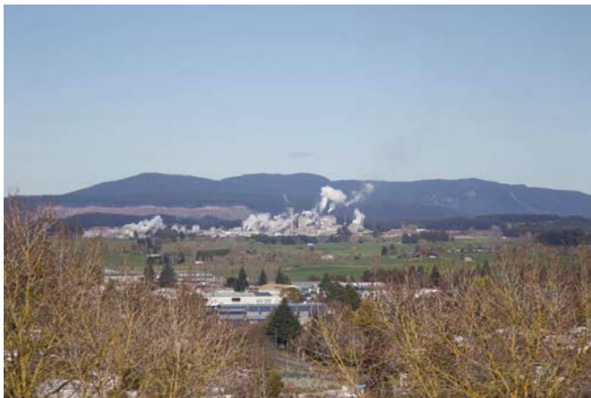
Tokoroa; Kinleith with Cashmore Hills in background