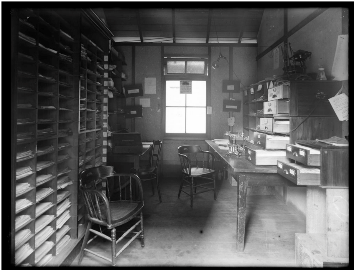
Interior of the record room at the New Zealand Army Recruiting Station in Victoria St West 1917